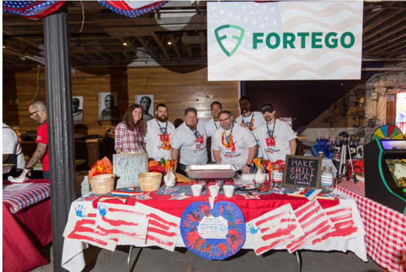
Members of the Fortego LLC team pose with their prize-winning entry as the "Judges Favorite" at the second annual Stars, Stripes & Chow event.