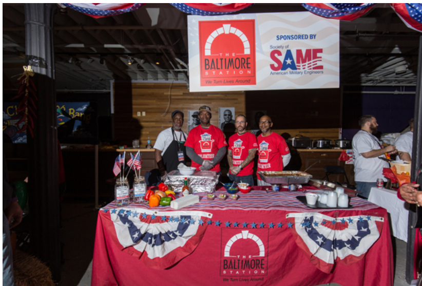
The Baltimore Station's team won the "People's Choice" award at the second annual Stars, Stripes & Chow event.

To submit photos for The Business Album, email swallace@thedailyrecord.com.